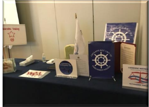
Flags were on display throughout the convention

Do you really want to know the answer? Answer: Branding our Association, Units and Club, "You will not only know us by name, but when these flags are flying high, it will forever be in your mind by sight. That's Virginia...They are from Virginia and a part of VSAP!!"