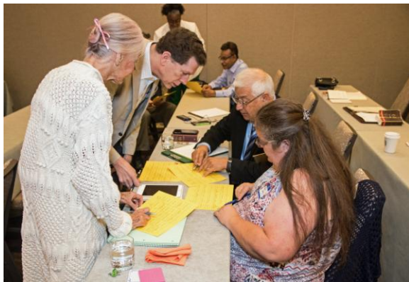
Leadership Conference attendees

Prior to the Leadership Conference, attendees were given several assignments. However, during the session attendees participated in many interactive group activities on future trends in leadership development, leadership styles, presiding and planning and implementing business practices for associations, units and club.