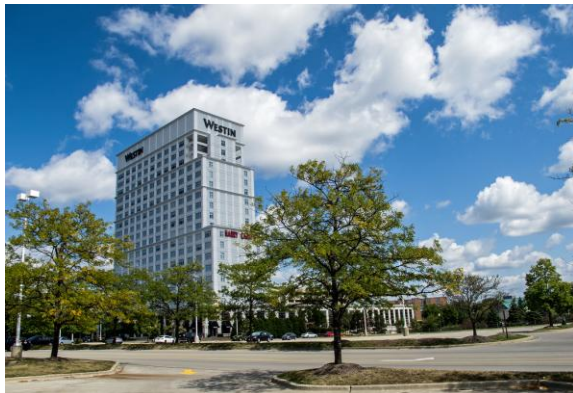
Westin Lombard Yorktown Center

VSAP President traveled through the beautiful blue skies to the windy city of Chicago, Illinois to reach the NAP 41 st Biennial Convention held at the Westin Hotel. With great expectation and excitement she traveled a day early for the Leadership Conference and two days to register for the NAP Convention.